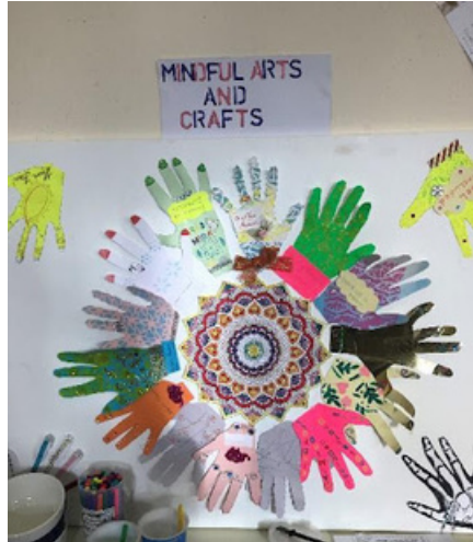
Arbourthorne Arts & Crafts Group Agreement Hands