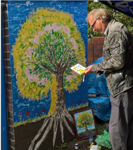
York House MCDT Community Mural title – "Tree of Life"