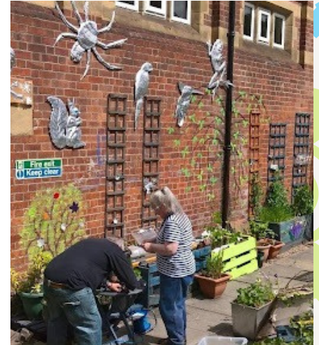
Park Centre metal work

At the end of the programme, participants join Ignite's Creative Community Network, with access to :-